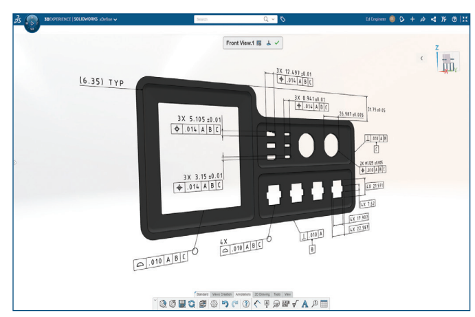
Quickly and intuitively define design requirements in 3D.